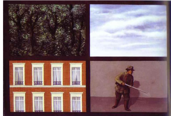
Rene Magritte "The Obsession"